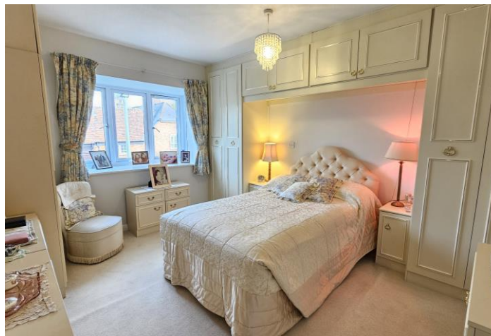
Approximate Gross Internal Area 64.34 sq m / 692.55 sq ft